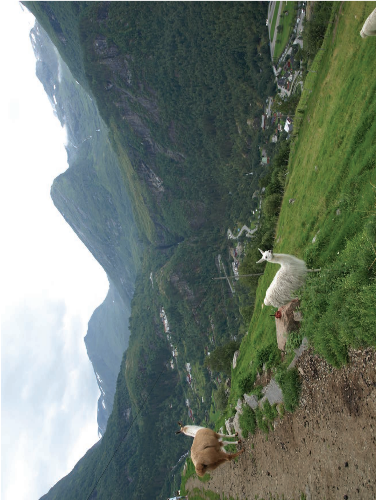
Photograph A for Question 1